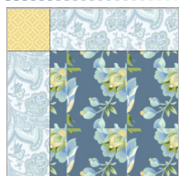
"Subtle Skies" Block #1 Make FOUR (4)

For "Subtle Skies" Block #1, use these fabrics: Large Floral Blue, Paisley Blue Tonal and Small Medallion Soft Yellow Tonal.