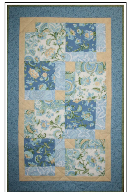
Completed "Subtle Skies" Table Runner

Congratulations! Now it's time for you to create your quilt sandwich, quilt your quilt and add the binding!