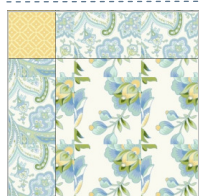
"Subtle Skies" Block #2 Make FOUR (4)

Repeat the same process as shown above for the "Subtle Skies" Block #2, making sure you use the correct fabrics: Large Floral White, Paisley Blues & Yellows and Small Medallion Soft Yellow Tonal.