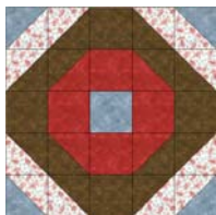
Block 8: Old Scraps Patchwork