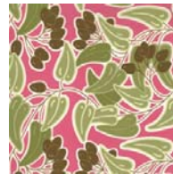
2 yards for Scrappy Backing

NOTE: You may prefer to use a fusible web product or a temporary spray product to help adhere your shapes to the blocks. The quilt shown above was made without these things, but if you are uncomfortable with pinning and freestyle sewing, feel free to use a technique that suits you best.