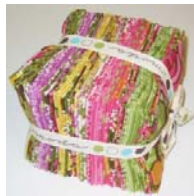
31 Santorini Fat Quarters