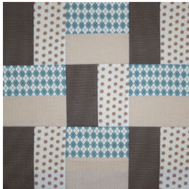
Block Twelve Two By Three

Let's make it easy and SEW this fun nine-patch, creating beauty from the basics! www.BOMquilts.com !