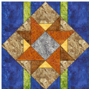
Pendleton Inspired Block #12

This is an applique quilt. You can do raw-edge applique, fusible web applique, needle turn applique or any applique technique you prefer. The templates show the seam allowances so if you want to use raw-edge applique or fusible web applique, please cut on the template lines and not on the seam allowance lines.