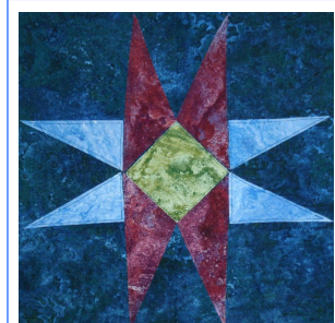
“Pendleton Inspired” Finished Block Block #8

Sew the Green center to the Blue background, then sew the Maroon and Blue to the Green Center. Secure them with your applique preference.