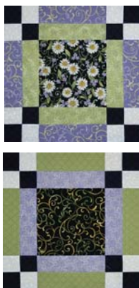
Block #1 - #4

Since there are a number of colorways in this fabric line, I will use the basic color of the fabric and you use your own fabric creativity to choose which fabrics you feel would be the best match for placement.