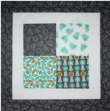
Botanical Beauty Block #1 February 15, 2016

“Botanical Beauty” features rich and luxurious fabrics with blocks designed to add a touch of whimsy with basic modern flares!