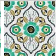
Fern in White