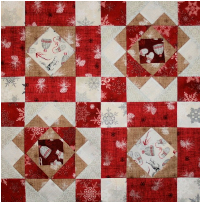
"Celebrate Winter" Block Set