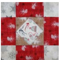
Celebrate Winter Block 1

See the Introduction page for the fabric requirements needed for the quilt project size of your choice.