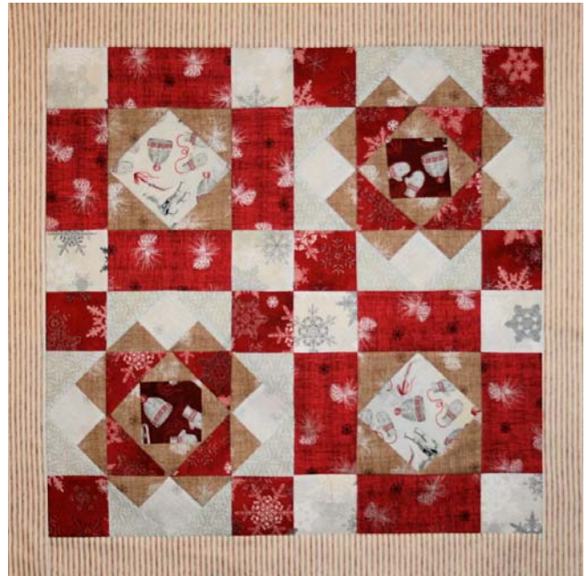
"Celebrate Winter" Block Set with Border (Table Topper)

Now, create your quilt sandwich with your quilt top, batting and backing then quilt as desired and add your binding.