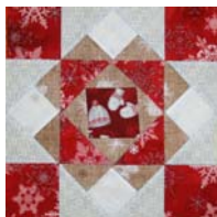
Celebrate Winter Block 2

Cutting for the "Celebrate Winter" Block 2. This is for ONE (1) block, you will need to make TWO (2) blocks for the Block Set: