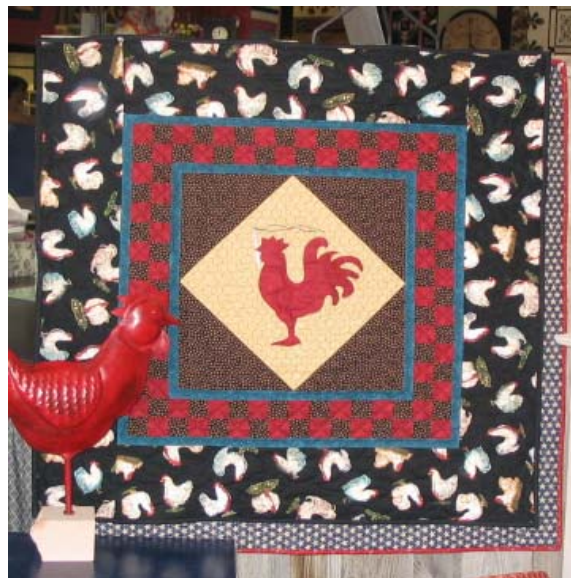
Finished! "The Red Rooster" Wall Hanging