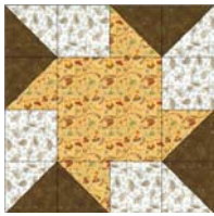
Block 12: Whirly-Gig