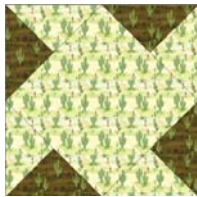
Block 7: Right & Left