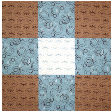
Block One Nine-Patch

Let's make it easy and SEW this fun nine-patch, creating beauty from the basics! www.BOMquilts.com !