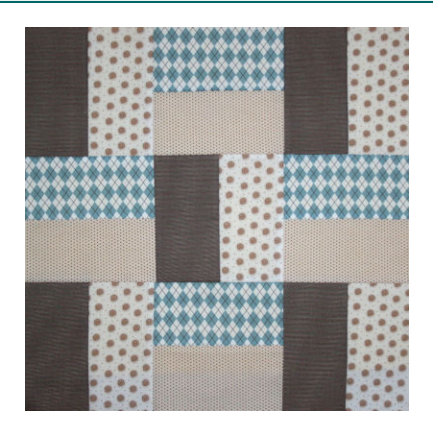
Block Twelve Two By Three

Let's make it easy and SEW this fun ninepatch, creating beauty from the basics! www.BOMquilts.com!