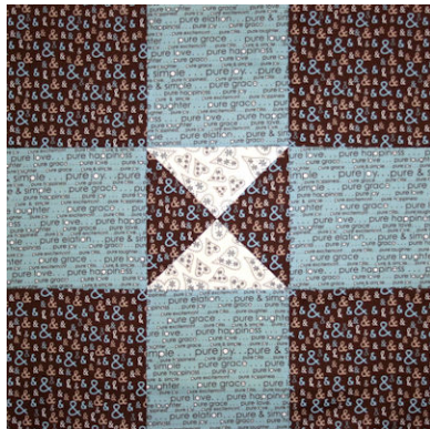
Block Two Practical Orchard

Let's make it easy and SEW this fun nine-patch, creating beauty from the basics! www.BOMquilts.com !