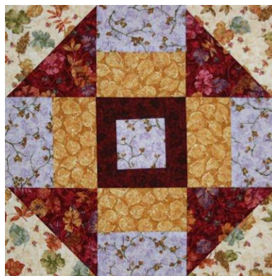
Bittersweet Churning Block 9

Retrieve your "Bittersweet Churning" 2012 Block of the Month free quilt project from BOMquilts.com and quilt fabric kit from www.AbbMays.com - the online quilt fabric shop that's ALWAYS open!