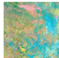
1 1/2 yards (includes sashing and border)