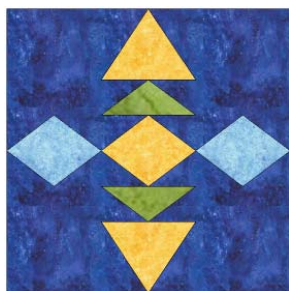
Pendleton Inspired Block #1

This is an applique quilt. You can do raw-edge applique, fusible web applique, needle turn applique or any applique technique you prefer. The templates show the seam allowances so if you want to use raw-edge applique or fusible web applique, please cut on the template lines and not on the seam allowance lines.