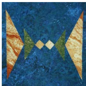
Pendleton Inspired Block #4

This is an applique quilt. You can do raw-edge applique, fusible web applique, needle turn applique or any applique technique you prefer. The templates show the seam allowances so if you want to use raw-edge applique or fusible web applique, please cut on the template lines and not on the seam allowance lines.