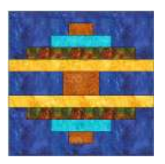
Pendleton Inspired Block #6

This is an applique quilt. You can do raw-edge applique, fusible web applique, needle turn applique or any applique technique you prefer. The templates show the seam allowances so if you want to use raw-edge applique or fusible web applique, please cut on the template lines and not on the seam allowance lines.