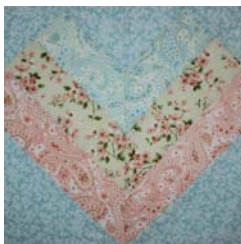
“Shabby Love” Block #11

All Seams a precise 1/4" Read ALL Instructions Before Beginning