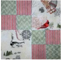
Celebrate Snow Birds Block 1