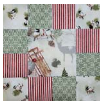
Celebrate Snow Birds Block 2