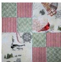
Celebrate Snow Birds Block 1

See the Introduction page for the fabric requirements needed for the quilt project size of your choice.