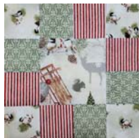
Celebrate Snow Birds Block 2