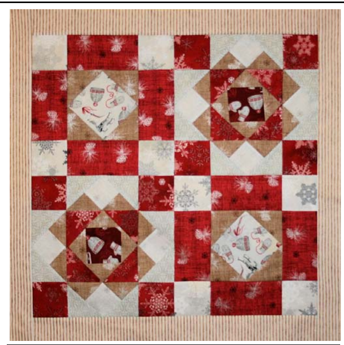
"Celebrate Winter" Block Set with Border (Table Topper)

Now, create your quilt sandwich with your quilt top, batting and backing then quilt as desired and add your binding.