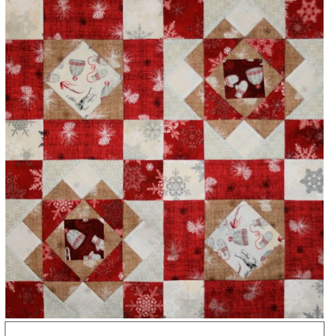
"Celebrate Winter" Block Set