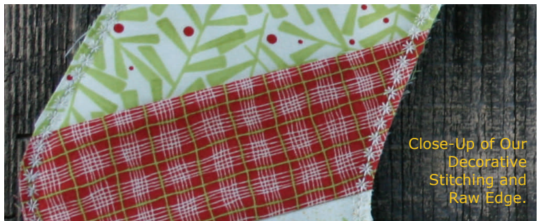
Close-Up of Our Decorative Stitching and Raw Edge.